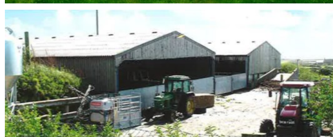
Boskednan House Farm for sale in West Cornwall (brochure attached)